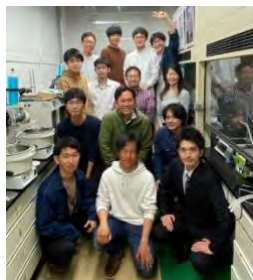
Tokyo Institute of Technology