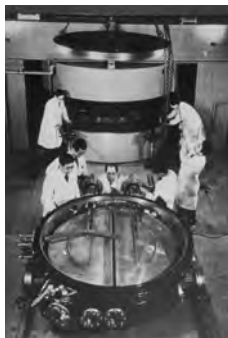
Nishina's second cyclotron

Nishina was not satisfied with the small model. Eventually, he built a second, larger cyclotron, though regrettably, as will be described later, his two early cyclotrons were dismantled and thrown into the sea after the end of World War II.