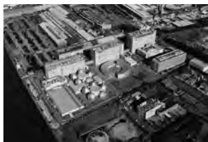
The Yokohama campus

In 1998, a center was set up in Yokohama, dedicated to genomic research. It has since developed into a number of centers, which today work in areas including genomics but also immunology, allergy studies, plant science, and nuclear magnetic resonance imaging.