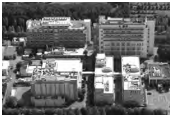
The Tsukuba campus

In the 1960s, there were three kinds of organization that did scientific research: universities, which were free to do the research they wanted, but also had to teach students; government