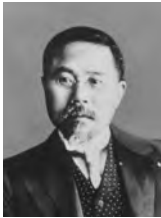
Dairoku Kikuchi (1917)