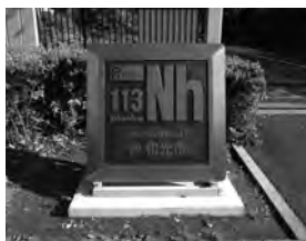
Plaque commemorating nihonium

The achievement began with experiments started in 2003 to create the new element 113. In July 2004, the group had their first success, as they succeeded in creating the new element 113 using the RILAC initial-stage