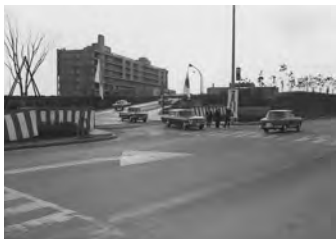
The Wako campus in 1967

now Wako City, a suburb in Saitama Prefecture toward the north of Tokyo. The site was part of the land that had been requisitioned by the US military.