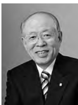
Ryoji Noyori (2003–2015)