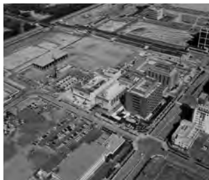
The Kobe campus

the west of Japan, was established to be home to a center studying developmental biology. A supercomputing center was later added in Kobe, as well as a facility dedicated to the use of functional positron emission tomography (PET) imaging.