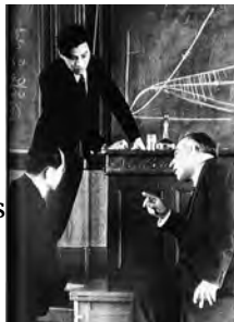
Bohr in Japan

— “You may remember that I was working in the Cavendish Laboratory when you came to Cambridge about a year ago ... I left Cambridge last September and came here for the purpose of learning the German language ... As my Institute in Tokio does not allow me to stay in Europe longer than two more terms, I do not know whether it is wise to set up new work. My chief wish is to study your theory of spectra and atomic constitution in details. But if anyone wants assistance in the experiment or the calculation, I should do it with pleasure.”