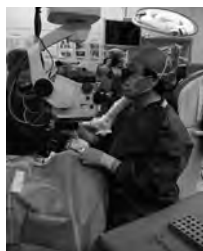
Surgery using iPS cells

At present, approximately 30 percent of RIKEN's scientists are women, and about 11 percent of laboratory leaders are women. An Office for the Promotion of Diversity, which was set up in 2018, is working to develop policies to further widen the road for women in RIKEN.