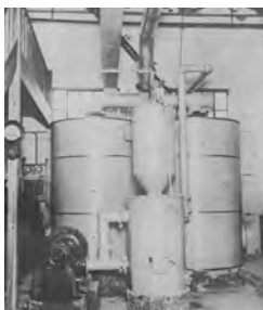
Adsole in use

application of the desiccant was in the air-conditioner that RIKEN researchers installed in the Hogakuzza—an early movie theater in Tokyo. The system was carefully designed for the 1,000-person capacity of the theater. The popularity of this first air-conditioner in Japan led to further installations of Adsole-based air-conditioning systems at other locations.